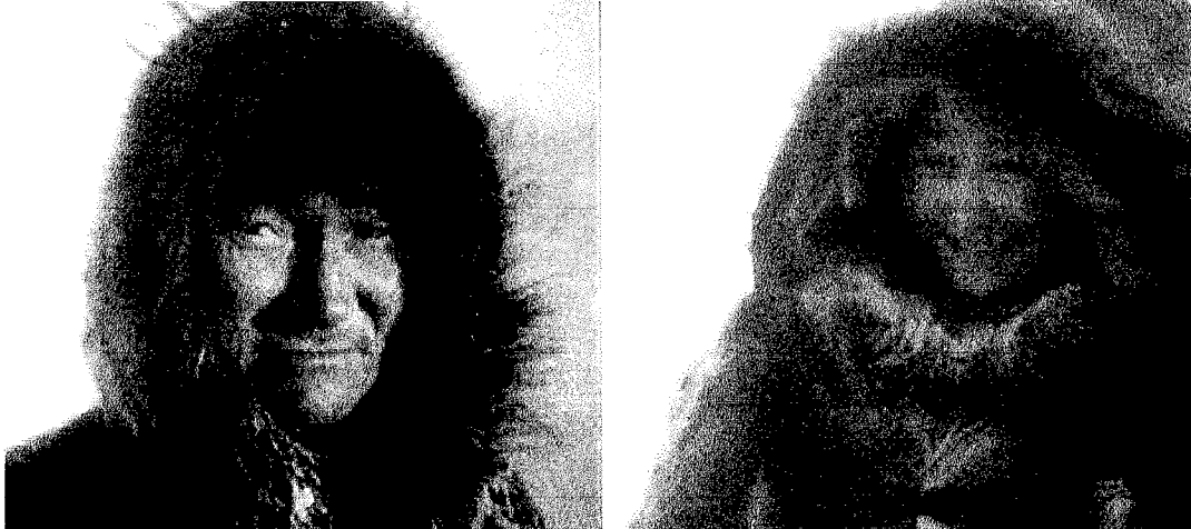
Nanook.....Nyla from Nanook of the North (Revillon Freres, 1922).