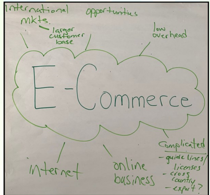
Brainstorming ideas about E-Commerce

For more information on future E-Commerce workshops, or for questions/comments please e-mail GEDC's Business Outreach Officer: horis@gedc.ca .